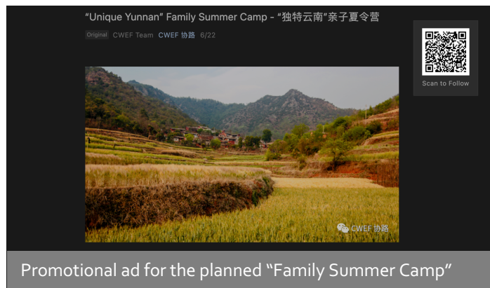
Promotional ad for the planned "Family Summer Camp"