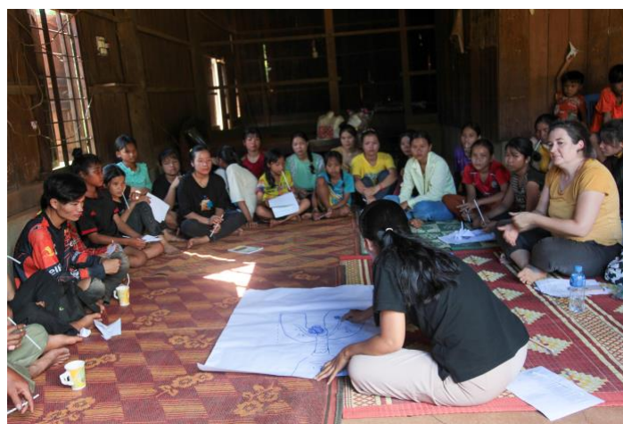
A recent CWEF community health training session in Cambodia

You can join His mission in Asia! We would love to partner with you.