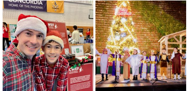
Scenes from the Christmas Bazaar

One week prior to our congregation's big Christmas event mentioned above, our family was also able to participate in another large Christmas event hosted by our kids' school. The Christmas Bazaar is a large annual tradition that made its 'big comeback' at the school campus once again this year, after several quiet years during the last 3 years of COVID restrictions here in our city.