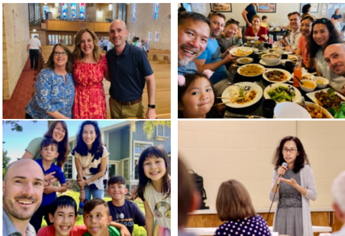
Reconnecting with family & friends this summer in the USA

I like to remember this awesome promise and word of truth from 2 Corinthians (above) when I think of you and the community of faithful partners who have joined our family in the work HE is doing here in Asia. Some of you have been walking this journey of faith, prayer, and generosity with us since the beginning — over 15 years ago. It's incredible — thank you!